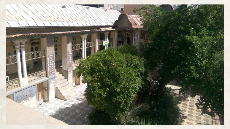
Figure 1. Behboodestan Namazi, the place that Research Office for the History of Persian Medicine is located there

Research Office for the History of Persian Medicine started to work in March, 2010. It is placed in a historical building, namely Behboodestan Namazi (the oldest alive and active clinic and health care center in Shiraz; dates back to 1925; Figure 1).