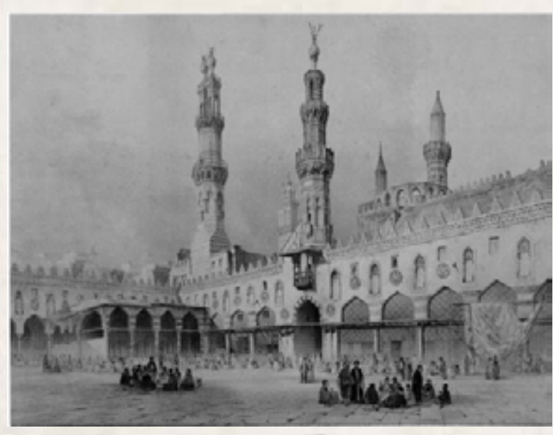
Figure 2. Al-Azhar mosque, main courtyard, 10<sup>th</sup>-18<sup>th</sup> centuries