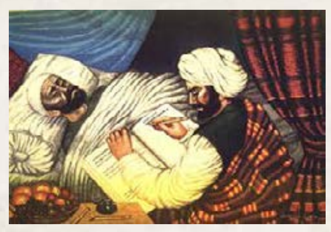
Figure 1. Muslim physicians excelled in the art of AI-Kahala (ophthalmology).

has been emphasized that a physician received a "license" after graduation, but there is no evidence of the existence of an equal, standardized or supervised system in medical education, although today copies of some treatises are available at the end of which a person has signed and testified that a certain student has read and understood a certain text in the presence of its author or a respected physician. Such testimonies are not equivalent to a license which a physician receives following graduation from an approved educational course, and the term "license" is not found in such documents.