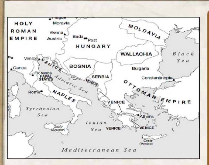
Figure 3: Venitian properties in the Levant