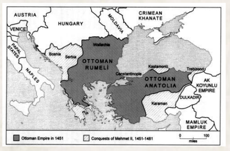
Figure 1. Ottoman advancement in the Levant