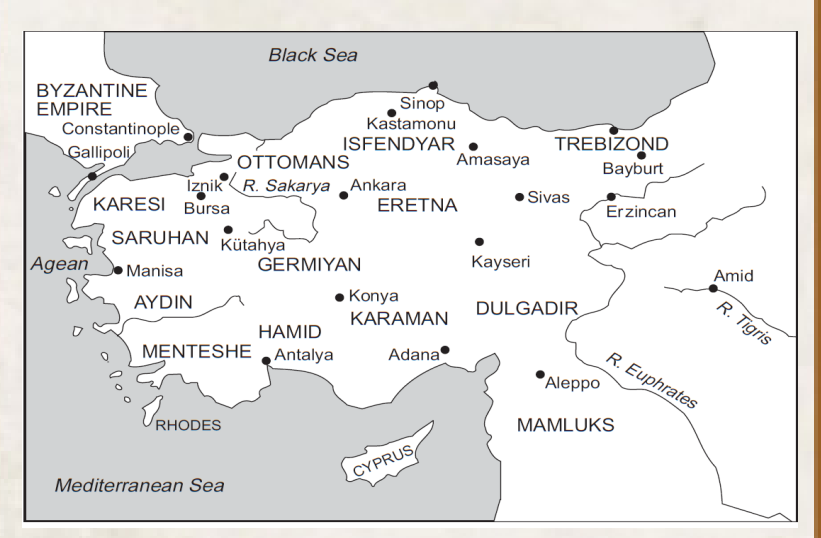
Figure 2. Powers in Anatolia

After a while, Venice sent Zeno to court of Uzun Hasan. He informed shah that Venice is ready to aid him to enterprise against Ottoman by sending 100 Galley.<sup>17</sup> Anyway, Uzun Hasan embraced zeno suggestions because he planned to capture Eastrn Anatolia. In 13 Rajab 875/1471, Venetian senate dispatched Josef barbaro to the Orient. In this circumstance, Venice played its equivocal policy which displayed perpetually and Aq Qoyunlu army stayed alone against Turks (Figure 2).<sup>18</sup>