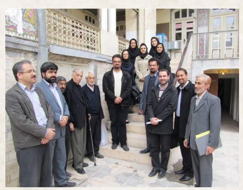
Figure 1. Prof. Moharreri (fourth from the left) visiting Behbodestan Nemazee museum.

"شعرت زبان فاخر شيراز عشق بود مضمون نسخه هاى خطت جز شفا نبود"