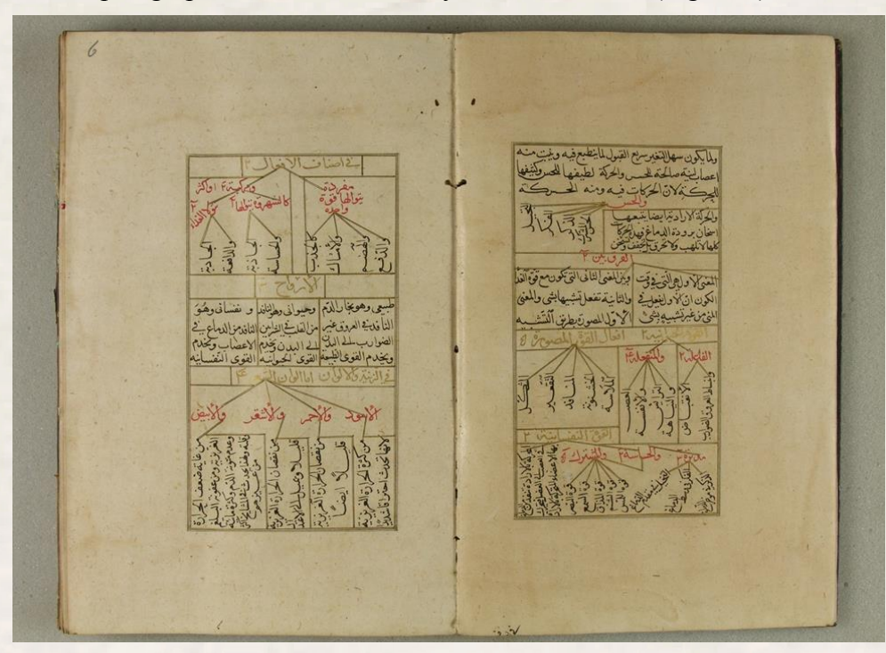
Figure 1. Photograph showing sheet 6 of Shajarat al-tibb (a tree of medicine); in Arabic language. as regard copy write; the book is available on websites as https://www.alukah.net/library/0/76592/

I chose this paragraph about the nervous system in the book (Figure 1).