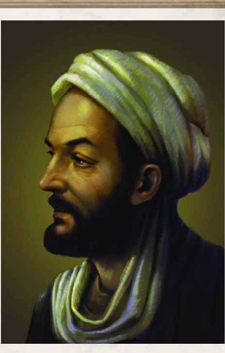
Figure 6. Portrait of Ibn Sina – Avicenna, the prince of physicians (980 – 1037 AD) (Khan, et al., 2020, pp. 173-175)