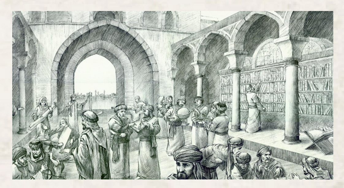
Figure 1. Bayt al-Hikmah (The House of Wisdom); a destination for intellectuals and an academy of knowledge attracting brains from far and wide during the Abbasids caliphate (750-1517 AD) (Algeriani and Mohadi, 2017).

This review aims to describe the early surgical efforts of five main surgical pioneers in the golden Islamic era: Rhazes, Haly Abbas, Albucasis, Avicenna, and Ibn Quff.