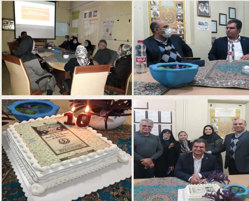
Figure 1. The 10th birthday celebration of the Journal of Research on History of Medicine

all around the world. The Journal of Research on History of Medicine covers all aspects of history of medicine worldwide and we will try to introduce this opportunity to the researchers in this field all around the world. I hope to success in our aims by the help of all of our contributors in the second decade of the journal.