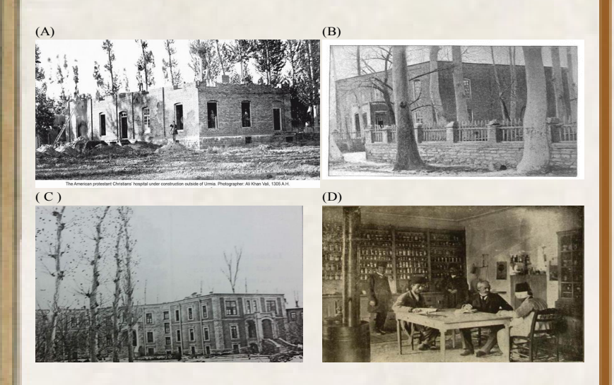
Figure 2. (A) and (B): The Westminister Hospital in Urmia, 1895, (C): The Westminster Hospital as an Educational Hospital, the First Modern Medical School in Iran, established by Dr. Joseph P. Cochran, (D): Pharmacy of the West-Minister Hospital. These images are reproduced with permission<sup>11</sup>, Copyright (1907).

showed in Table 1. Urmia University of Medical Sciences is located in Urmia, West Azarbaijan province, North-West of Iran.