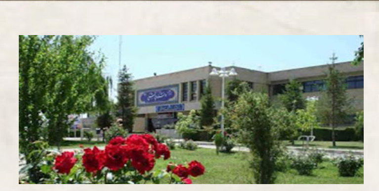
Figure 4. Current Urmia Medical Faculty, 2020

Table 1: Statistics Related to Urmia School of Medicine, 2020.