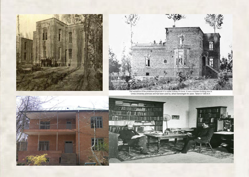
Figure 3. The old wooden building can still be seen near the present-day Urmia University in Daneshkade Avenue. These images are reproduced with permission<sup>12</sup>, Copyright (1907)

Figure 2. (A) and (B): The Westminister Hospital in Urmia, 1895, (C): The Westminster Hospital as an Educational Hospital, the First Modern Medical School in Iran, established by Dr. Joseph P. Cochran, (D): Pharmacy of the West-Minister Hospital. These images are reproduced with permission<sup>11</sup>, Copyright (1907).