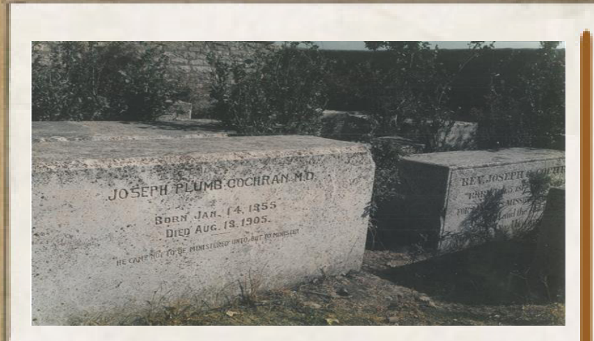
Figure 8. The American Cemetery in Village Sir of Urmia City, Iran, 2005.

After Dr. Cochran's death and the closure of the Medical School and Hospital, the French built a hospital in Urmia in 1917. Then, Dr. Cochran's son, Irom Cochran, founded the Memorial Hospital of Dr. Cochran (Figure 9)<sup>25</sup>.