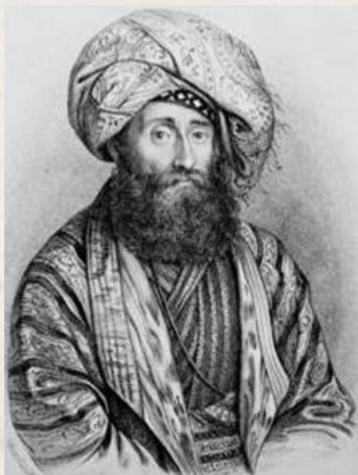
Figure 2. Dr. Honigberger in the eastern costume. Courtesy: Bobby Singh Bansal, The Lion's Firanghis: Europeans at the Court of Lahore, (London: Coronet House, 2010), 126.