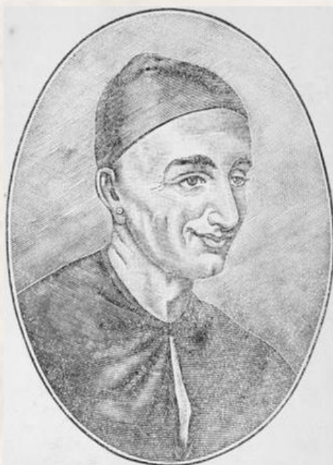
Figure 3. Faqir Haridas' appearance.

when the body is deprived of oxygen, causing unconsciousness or death; by suffocation) for several days. He successfully performed his experiment in the presence of Maharaja Ranjit Singh , General Ventura, all the Sikh courtiers and some Englishmen such as British political agent of Ludhiana named, Captain Wade and an English doctor etcetera. By the order of Ranjit Singh he buried for several days in a specially build vault. On the fortieth day, the chest was unlocked and Haridas was found in the unchanged, cold and inflexible position. By and by he was restored to life by his assistants' healing. The details regarding this, available in the books of Dr. Honigberger and, an eye-witness account of William Godolphin Osborne (military secretary to Lord Auckland, Governor-General of India) on pages 130-137 and 123-129, respectively. As mentioned aforesaid, that event did not happen in front of Dr. J. M. Honigberger but he did confirm this from authentic people He strongly supported the authenticity of the claim of Faqir Haridas and gave some scientific examples. (Figures 3 and 4)