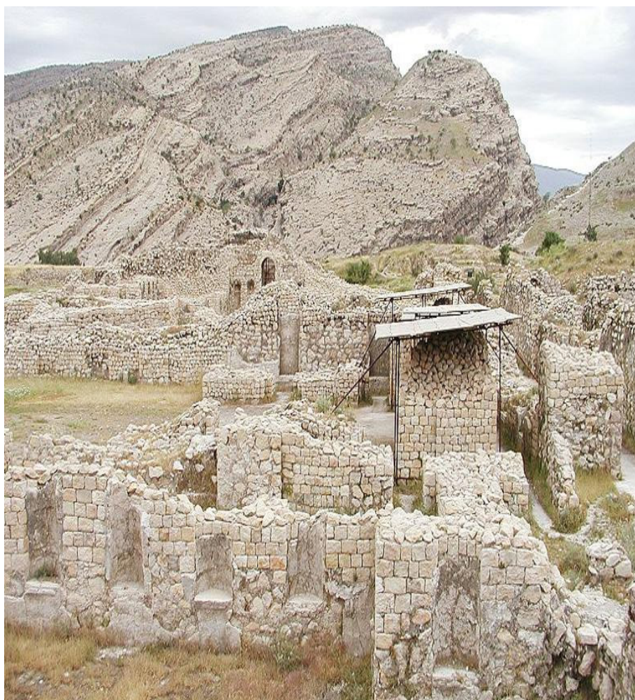
The ruins of Bishapur, Fars province, Iran