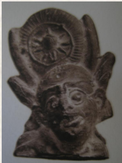
Figure 5. Hellenistic terracotta figurine representing the head of an Isis priest with an exophthalmos

In the shrines of healing gods and especially in those of Asklepios (Asklepieia) and Amphiaraos (Amphiaræia), much gold, silver, marble have been dedicated but mainly