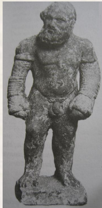
Figure 7. Hellenistic terracotta figurine representing a boxer with swollen ear (Athens, National Archeological Museum: 5764)

Finally, the monstrous figures of ancient Greek mythology with one eye like Cyclops (Figure 11) and more than one like Argos Panoptis (Greek: the one who can see everything) (Figure 12) who had up to 100 eyes on his body, should not be related to similar monster births, because mythology is an area which does not accept any pathological phenomenon,