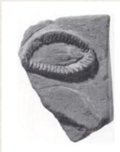
Figure 9. Eye votive limb from the Asklepieion of Corinth (Corinth, Archeological Museum of Ancient Corinth: V208)