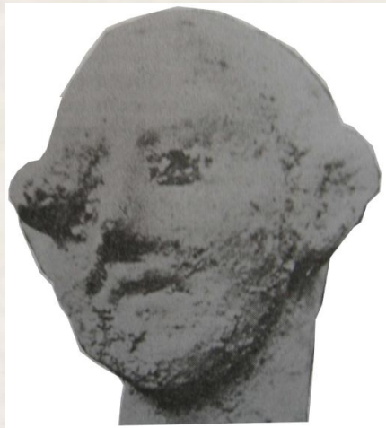
Figure 6. Hellenistic terracotta figurine representing the head of bearded man with a huge bulge in the right eye in the region of the eyebrows

terracotta votive limbs in the form of eyes 15 . The inscriptions of such dedication and the survived eye-votive limbs do not give us any information about the ocular diseases of the dedicators. Probably cataract and other refractive abnormalities were the main reasons for dedication; therefore, there were no signs of these diseases on votive limbs.