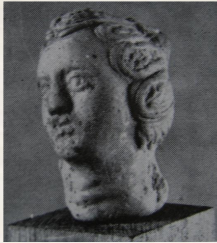
Figure 4. Hellenistic terracotta figurine representing a woman with goiter and exophthalmoses