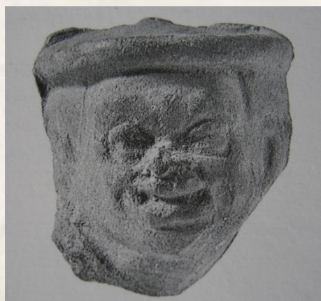
Figure 2. Hellenistic terracotta figurine representing a boy's head with Down's syndrome

Three other Hellenistic terracotta figurines probably represent the condition of exophthalmos. The first one dated to the 1st century BC and found in Troy, represents a woman's head with bulging eyes (Paris, Louvre: D 556) 9 and probably a goiter as we can interpret the bulge on the throat, which is described in the official presentation of the figurine 9 (Figure 4). In this case, the exophthalmos is obvious and probably is a symptom of Grave's disease represented in the figurine. The other two examples represent male heads with bulging eyes but the exophthalmos is lesser than in the female one. In these examples, there is not a goiter; therefore, we cannot specify the exact disease which provoked the exophthalmoses. The one figurine found in Crete (Kobenhavn, Nationalmuseet: 1436) 10 depicts a beardless man and the other from Egypt (Paris, Collection Fouquet: 361) 11 figures an Isis priest because he wears a hat with horns between which there is a