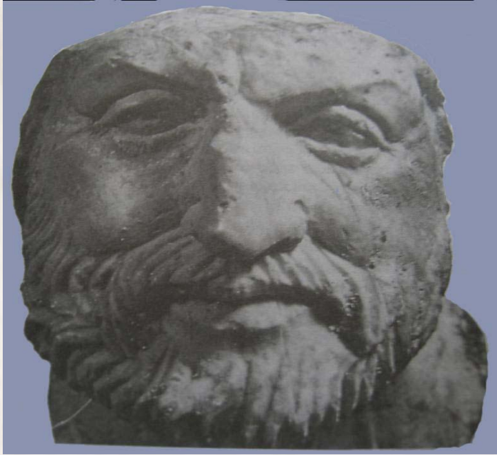
Figure 8. Hellenistic ivory portrait of Philippe II of Macedonia