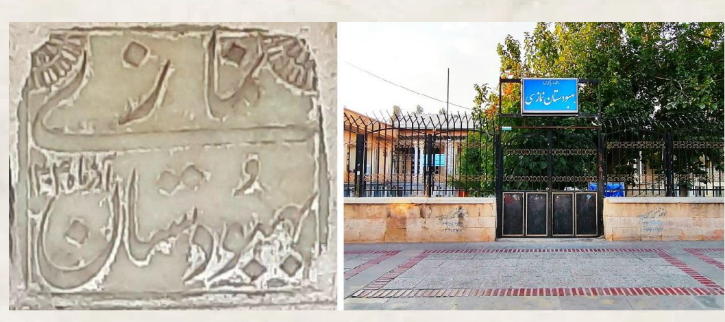
Figure 3. Left: The original sign of Behbudistan Namazi, right: Current entrance gate of Behbudistan Namazi

Now, after 10 years publishing the journal of research on history of medicine continuously, in this paper the analysis of the content of the journal is presented. It helps us to find the status of the journal and try to improve it during its 2nd decade of publishing.