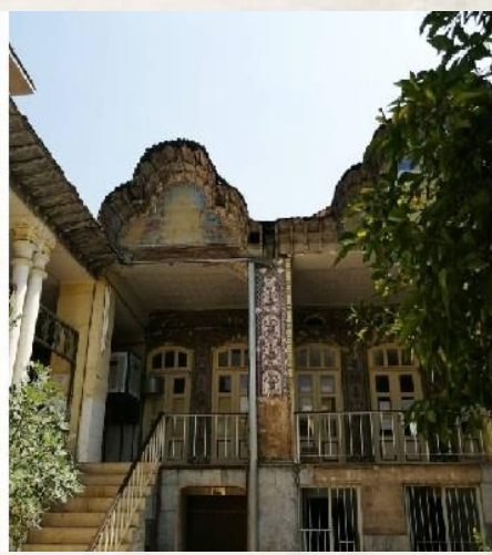
Figure 2. Behbudistan Namazi; left: When it was built (the copyright of this picture is anonymous because it is very old), right: Nowadays (Photo is taken by the author)