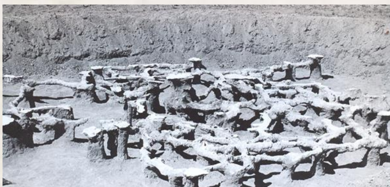
Figure 2. Molding the nest of M. persicus near Aq Bolagh-e Morshed village, 1965

With a regular and hardworking attendance in field operations and the nocturnal hunt of foxes and other wild animals, he played an important role in scientific progress in this field in Iran. He was also involved in the project of recognition of wild plague loci by serum experiments in foxes 19 .