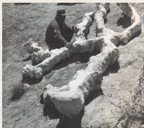
Figure 3. Mohammad Hanifi next to the gypsum mold of Fox nest; Bam Khanbaghi in 35 km from the Research Centre for Emerging and Reemerging Infectious Diseases, The Pasteur Institute of Iran, Hamadan, 1970