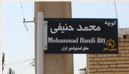
Figure 6: Naming a passage of Akanlu village Mohammad Hanifi, 2018

In 2018, an alley was named Mohammad Hanifi in Akanlu village. (Figure 6)