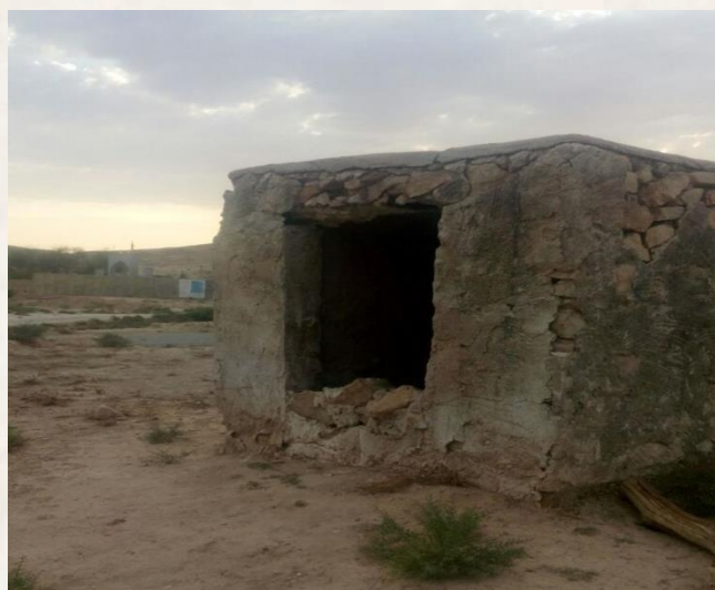
Figure 2. The front view of a Dakhme in the village of Boai Sofla in Kohgiluyeh (Dehdasht)