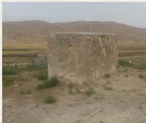
Figure 1. A Dakhme in the village of Boai Sofla in Kohgiluyeh (Dehdasht)

water, wind, earth and fire. Hence, they believed that the corpse would contaminate water or soil, and that anyone who touched the corpse should take a bath immediately. In Vandidad, it is stated that in order to keep water and soil clean, the body should be placed on a rock or on top of a mass of lime. Or the body should be placed in a closed coffin made of stone, called a dakhme . Europeans call these tall buildings silent tower. (Nass, 2006: 473) Zoroastrians believed that the soul of the dead was present around the corpse for three days after death. After that, a demon named “nasav”, whose job was to decompose the corpse, would come. The wind then would take the soul to the chinvato bridge so that the three judges, Mithra, Soroush, and Rashnu, pass judgment on their souls. (Hawar, 1996, p. 199) Pietro della Valle stated that the gabrs (Zoroastrians) did not bury their dead, but would keep the corpses in special places with the help of scaffolding with their eyes open so that the corpse either decompose itself or becomes the prey of birds. Of course he wrote that he saw the graves of gabrs from outside, but never saw inside the construction. (della Valle, 2002: 67) With this explanation, we described the dakme of Dehdasht, although they were different from the above dakhme . (Figures 1 and 2)