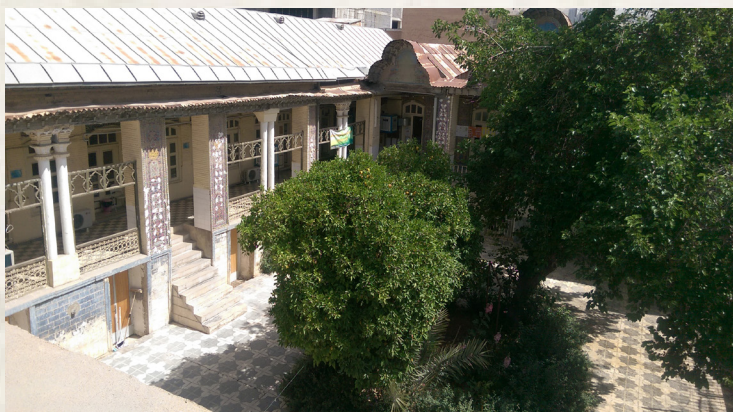
Figure 1. Behboodestan Namazi , the place that Research Office for the History of Persian Medicine is located there

Research Office for the History of Persian Medicine started to work in March, 2010. It is placed in a historical building, namely Behboodestan Namazi (the oldest alive and active clinic and health care center in Shiraz; dates back to 1925; Figure 1).